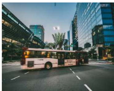
travel by bus