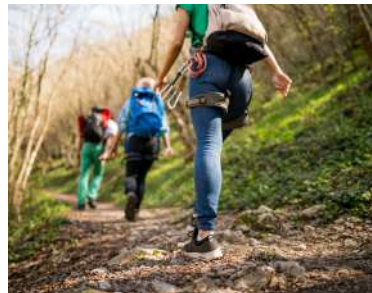
go on foot