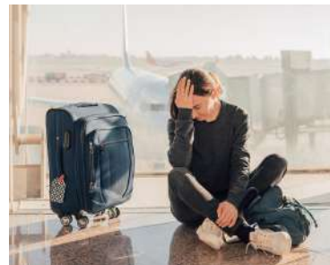
miss a flight