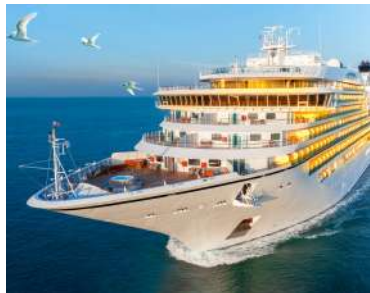
travel by ship