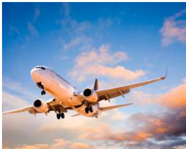
travel by plane

Padarbojies ar vārdnīcu! Noskaidro , kā frāzes zem attēliem ir latviešu valodā. Pieraksti apakšā katram attēlam.