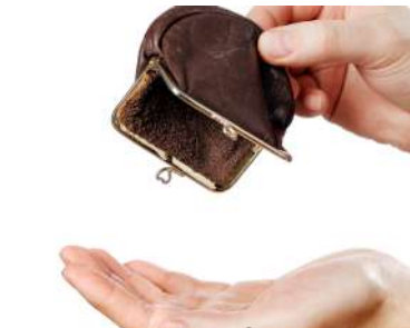
run out of money