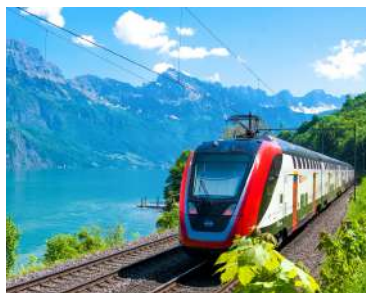
travel by train