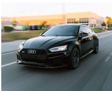
travel by car